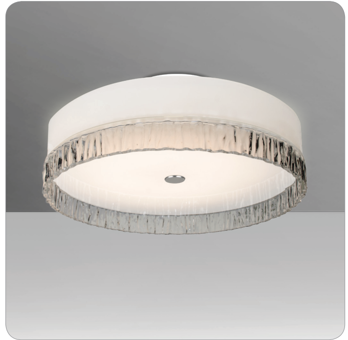
OPAL/SMOKE STONE (PACO19CLC)

UL or ETL Listed. Suitable for Damp Locations (interior use only).